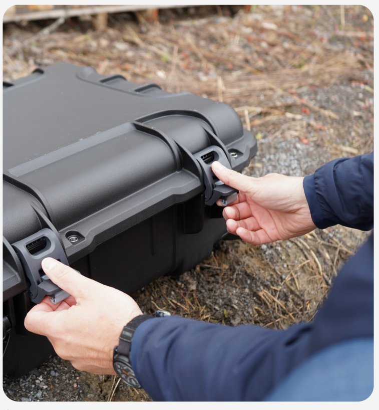
6x Powerclaw Latches