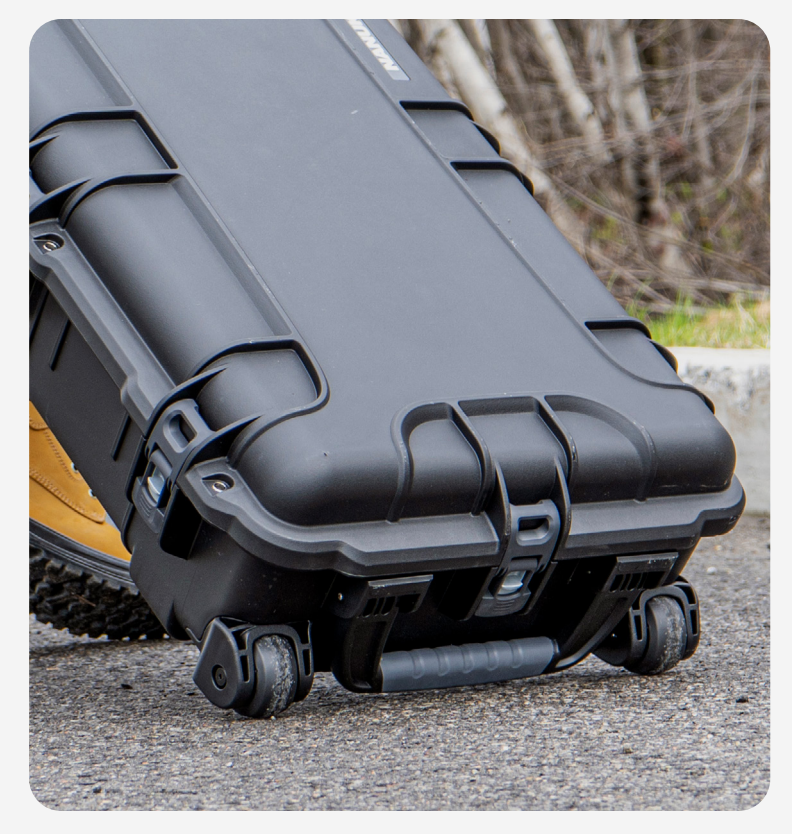
2 Large and Strong Polyurethane Wheels